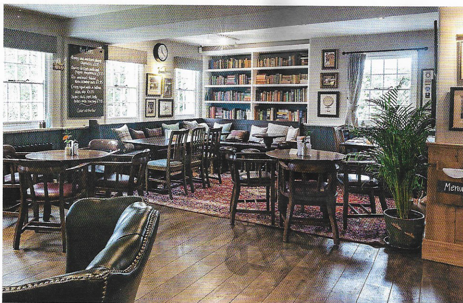
The Fox Revived has undergone a total refurbishment