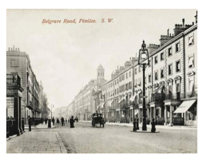
Belgrave Road, Pimlico

Mary's dowry not only included "The Five Fields" of modern-day Pimlico and Belgravia, but also most of what is now Mayfair and Knightsbridge. Understandably, she was much pursued and in 1677, at the age of twelve, married Sir Thomas Grosvenor, 3rd Baronet.