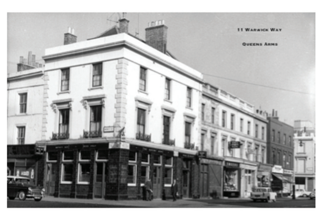
Queens Arms, 11 Warwick Way, SW1 - circa 1963