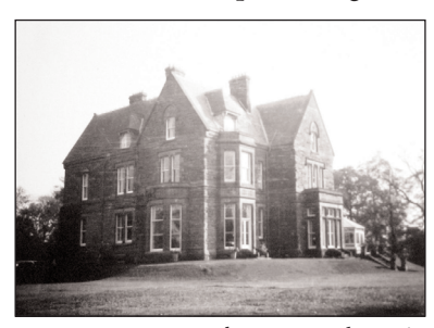
Westwood Grange in the 1960s

"light, airy, and tasteful atmosphere without any way detracting from its real character". At this time the property comprised the house, gardens, paddock and entrance lodge which stood alongside the original driveway.